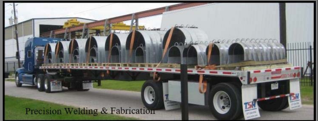
Precision Welding & Fabrication

Sincerely, Precision Welding and Fabrication